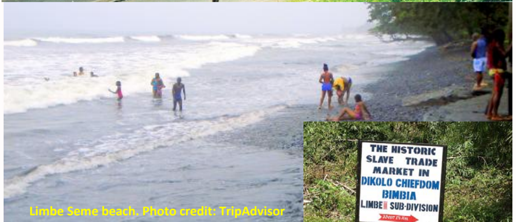
Limbe Seme beach.