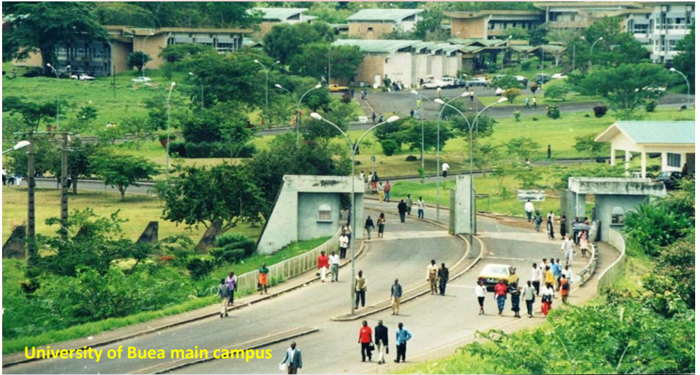
University of Buea main campus